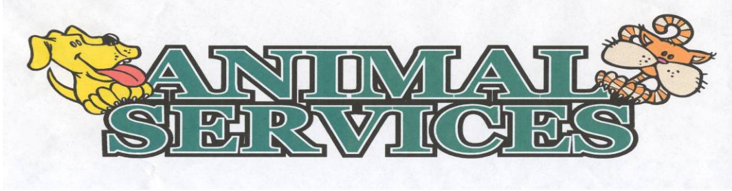
Animal Services Unit Calls for Service