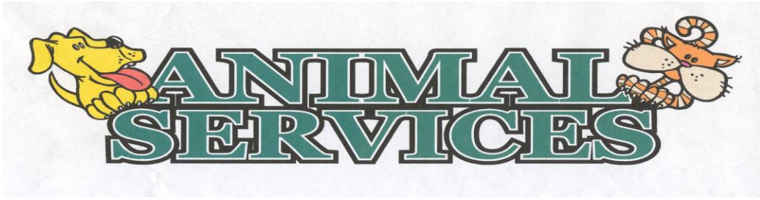
Animal Services Unit Calls for Service