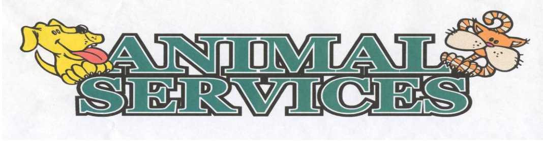
Animal Services Unit Calls for Service